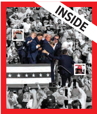
Witnesses of the shooting at the Trump rally in Butler July 13 reflect on that tragic moment. Page A-9