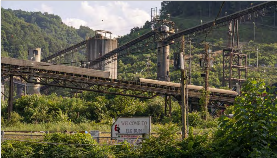
One of Elk Run Coal Company's mines in Whitesville, W.Va.

sources in 2011 after one of the nation’s worst mining disasters: The Upper Big Branch Mine explosion in West Virginia, where 29 workers were killed in a coal dust explosion.