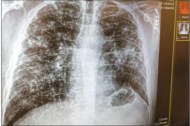
This X-ray shows an unidentified coal miner who has been diagnosed with advanced black lung.

Though the Centers for Disease Control and Prevention pushed for the new stan-